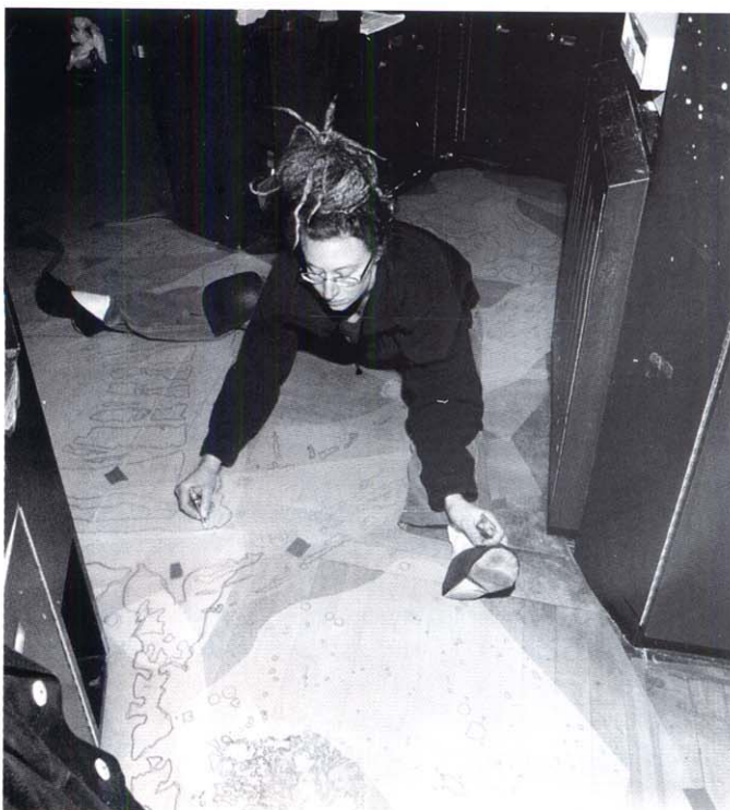
Opposite page: Ingrid Calame, hoo-koo-koo-koo , 2003, enamel paint on aluminum, 72 by 72 inches (courtesy James Cohan Gallery). Above: Ingrid Calame making the drawing for Secular Response 2 in the main room of the New York Stock Exchange, May 2001 (photo by Shelby Roberts courtesy the artist).

Such thoughts invite trepidation. Pollock's drip is the most powerful, iconic sign in modern painting. 1 The drip and Pollock's command of it were innovations so totalizing that from their inception to now, painting has struggled to negotiate their impact. One grasps at successors, parsing the legacy: Twombly's scrawl; Klein's performances; Warhol's oxidation paintings; Marden's skeins. 2 Avoidance or parody have been the dominant responses, for, as Kirk Varnedoe observes, "Pollock himself seemed to have staked all possible claims on his own terrain." 3