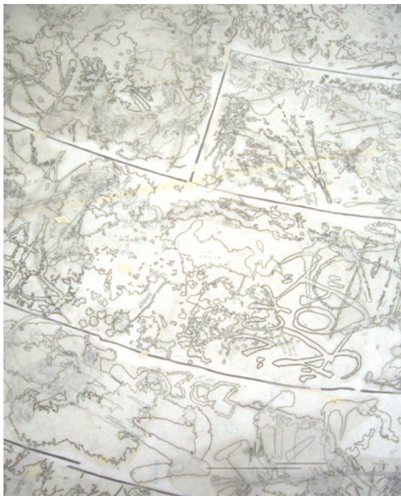
FIGURE 17 [OPPOSITE] Secular Response 3A (Tracings up to the L.A. River placed in the Clark Telescope Dome, Lowell Observatory, Flagstaff, AZ) installed at Art Gallery of Ontario, Toronto, Canada latex and enamel paint on wall, 2006, 16'6" × 17'5"

According to Immanuel Kant, the aesthetic experience offers no concept by which we might know works of art. See the philosopher's Critique of Judgment [1790], trans. Werner S. Pluhar (Indianapolis, Ind.: Hackett, 1987).