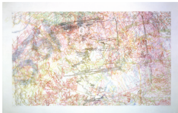
FIGURE 3 [TOP] #180 Working Drawing color pencil on trace Mylar, 88" x 136", 2005

In the 1860s, the French poet Charles Baudelaire noticed that the new experience he called "modernity" brought with it an urban type, the flâneur or stroller, whose steady gaze along the freshly-made boulevards of Paris brought modernity's features into view. 1 Calame, a contemporary flâneuse , stalks interior and exterior spaces for indexes of the inadvertent: the shapes made by stains, tire marks, and graffiti [Figures 4-6]. These she transfers to transparent Mylar sheets on a scale of 1:1, recording the location and date of each find. In the studio she selects tracings from her archive, reconfigures them by laying one atop the other, and assigns a color to the outline of each tracing. The configuration made by the palimpsest of transparent Mylar sheets determines the constellation of her final drawings, paintings, and wall works. Tracings from two locations are overlaid in the color pencil drawings and each trace mark is retraced in its own color [Figures 7-8]. In the move from drawing to painting, Calame considers the often dense areas of silhouetted line in the drawing for their overall shape, and she intuitively selects a color from that area of the drawing. Although the paintings are constructed from the drawings bit by bit, with one section at a time in view, the artist never changes a color choice once she has made it. 2 With the exception of the single-color wall works, Calame's color spans the continuum from lushly natural to patently artificial;