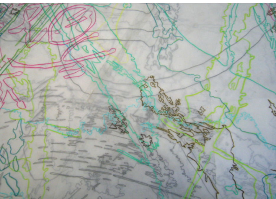
FIGURE 5-6 [OPPOSITE, TOP] The tracing process at the Los Angeles River, 2005