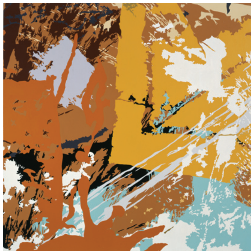
FIGURE 10 vuuUm—mum enamel paint on aluminum, 48" × 48", 2004