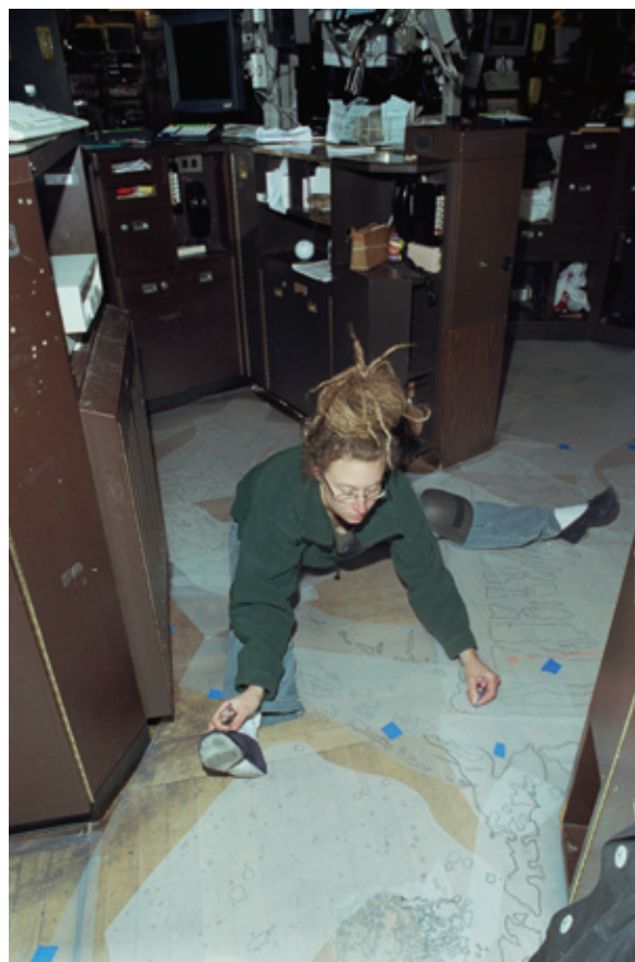
FIGURE 15 Calame tracing in the NYSE, 2001

These questions amplify in Secular Response 1, 2, and 3 . Cutting tracings from one, exterior, location to fit within another, interior, one, the artist tackles the age-old conundrum of infinity: how, philosophers have asked, might we capture the vastness of the cosmos within the net of human reason; how, scientists have queried, might we transform the chaos of nature into a system of laws whose fundamental principles we might understand, and even replicate [ Figures 14–15 ]? Calame's secular responses do not provide an answer. Instead, these projects call into question outside and inside, the local and the universal, as well as the assumptions, ideas, and concepts on which religious, economic, and scientific institutions rest. Secular Response is an intervention in the very best sense of this term as an artistic tactic: these projects implode categories and concepts. Through the artist's viewfinder we experience part and whole as mutually inflecting, and never entirely told apart. Religious faith, economic facts, and scientific laws may just be semantic complexities which we hew into fixed registers of meaning in order to make our world legible. As Calame's specific tracings of stains and her constellations' view of nowhere