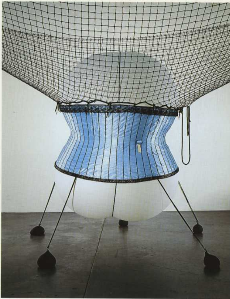
MAEBE (detail) latex, fabric, rope, plaster 1997 144"x 96"x 96"