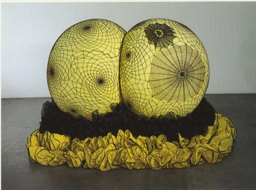
NETELLA latex, fabric, cotton 1997 48"x 96"x 60"

"Maebe", a towering fem-ish figured royal blue balloon is our first guide to the show. The twin swell of her balloon body emerges from the bosom and bottom of an enormous powder blue satin corset, forming an hourglass – though by no means wasp-waisted-figure. "Maebe's" chitinous femininity is a direct descendent of Mae West's voluptuous but hard boiled saloon style challenge to sexual codes. Maybe a man, or maybe a woman, there is nothing natural about "Maebe's" femininity. "How'm I Doin'?" is her question: completely confident of her allure, she challenges the possibility that she might appear excessive in her will to womanhood. The chasm between the glitzy glamour of her outfit, and her more than curvaceous proportions leads to a jarring rift with the societal ideal. Like the old aunt who smothered you in the fleshy cleavage of her embrace, "Maebe" is terrifying and funny at once.