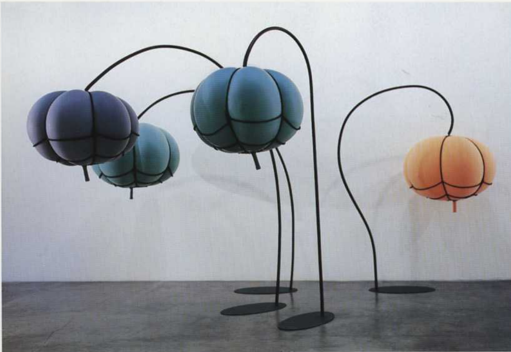
FOREST/BUDLETTES latex, rope, steel, rubber 1997 each unit approximately 96"x 96"x 36"

Davidson's most ominous piece is a forest of flowers, grouped in threes and fours, spookily somnambulant incubators. Bulbous blue and green heads droop from arched stems with weighted fullness; nozzles dangle from their segmented centers. In keeping with the intrinsically hermaphroditic nature of plants, Davidson has not garbed them in festive gender attire. As the only heads in "How'm I Doin'?" the fact that "Forest of Flowers" represents a visceral rather than cognitive bodily function inverts the usual hierarchy of mind over matter. Their pregnant belly/heads, petal-less and about to go to seed, are as portentous of death as of life, and their sickly sweet blossoming infects the rest of the show.